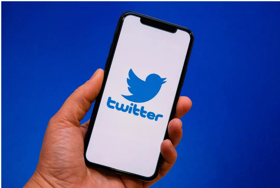
Twitter's website got a makeover.

Twitter on Wednesday unveiled a new design for its website, including a new font, higher-contrast colors and less visual clutter. The social media company said the changes are meant to make it easier for people to scroll through text, photos and videos.