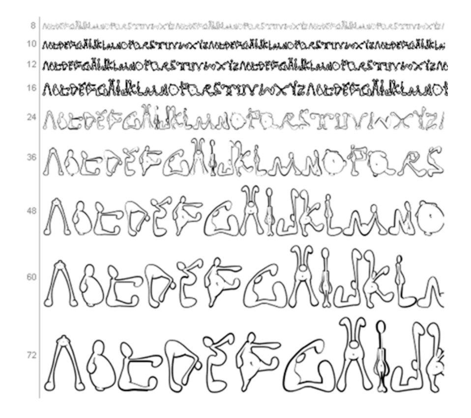
Figure 2. Examples of Putty Peeps typeface.<sup>77</sup>

Interestingly, from a professional typeface designer's point of view, questions about typefaces such as Christmas Lights, Christmas Tree, and Putty Peeps, are probably moot. Although it may be true that copyright law is more likely to protect these typefaces than other less