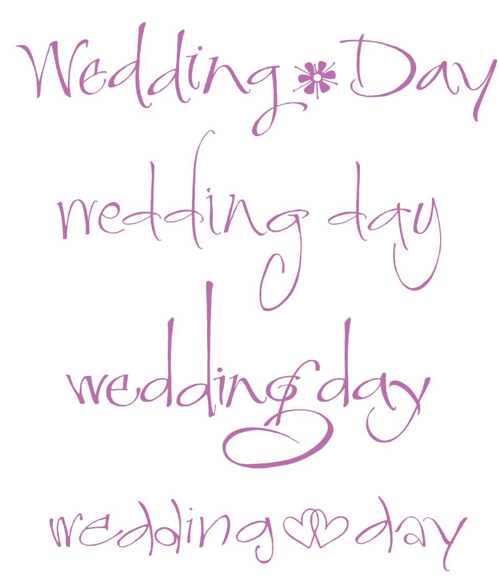
© Mandalay Limited 2009 All rights reserved.